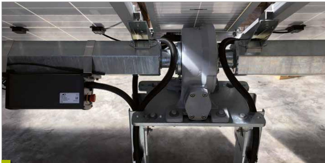
Independent row tracking