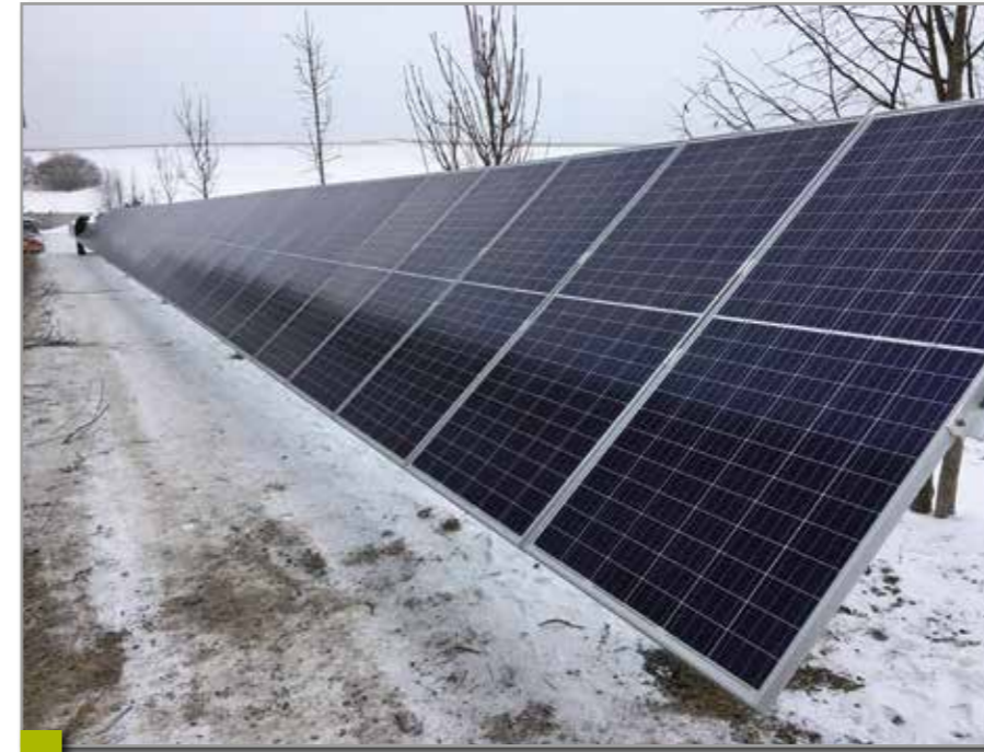
Testinstallation – rows up to 84 modules, 72 cells