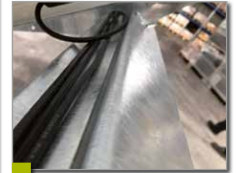
Integrated cable management