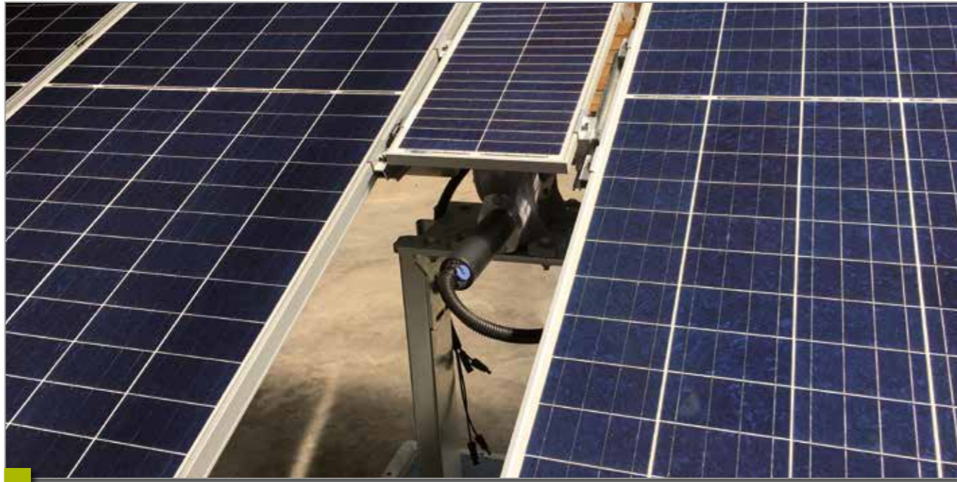
Self-powered tracking system